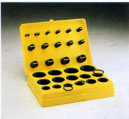
KIT C= EK-30382AS EK-30391PG EK-30386MM EK-30372C82