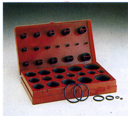
KIT E= EK-32407AS EK-32426MM EK-32390C82